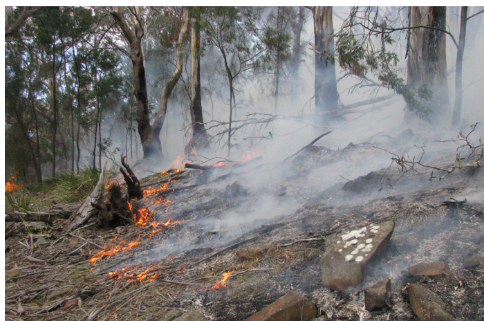
Lighting line 2 – across the top of the ridge