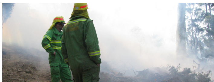
The Forestry Tasmania team patrolling the southern boundary