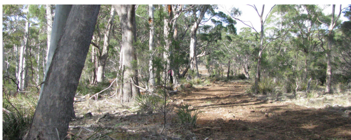
The dozed southern boundary

1 x lighting team – two people with a drip torch each. The two fire fighting units were mopping up and patrolling behind the lighting team.