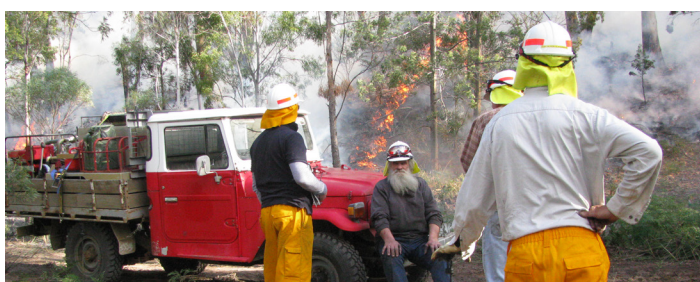
Taking a break and watching how the fire behaves is critical to ensure the burn goes safely and according to plan