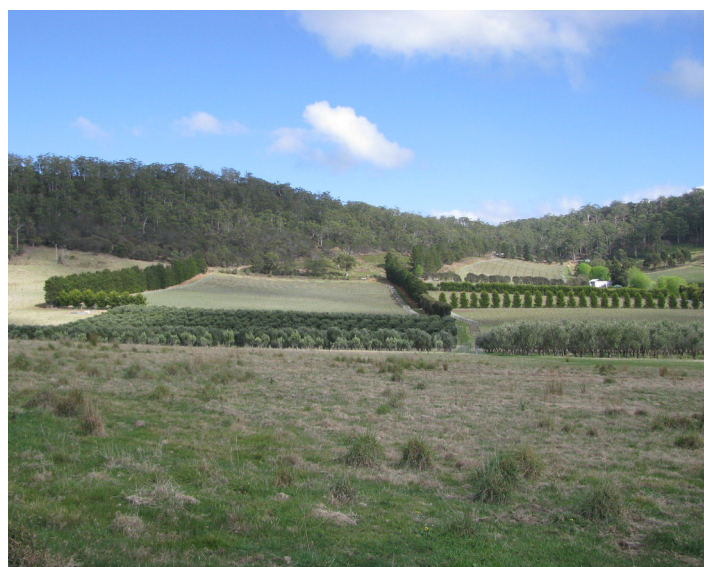
The burn unit was the hill in the background, with the northern boundary in the saddle between the hills. Note the proximity to the vineyard