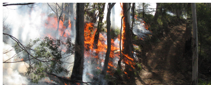
Lighting along the eastern boundary (line 4). The fire behaviour was elevated due to the easterly wind and the slope, however the boundaries at the top of the hill and along the southern edge were secured