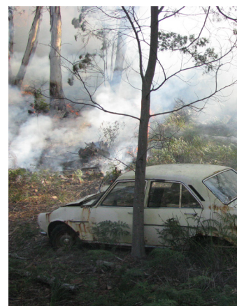
Asset protection during the burn