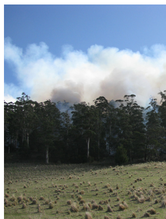
The burn after lighting line 4, along the bottom of the hill

The window for suitable conditions for this burn was made challenging due to the proximity to vineyards. Wine grapes are extremely vulnerable to smoke taint during the autumn months, which is typically the ideal time in which to undertake planned burning. However, this vulnerability combined with the risk of a summer wildfire burning the vineyard means that managing fuel loads around vineyards is critical for risk mitigation. This case study provides an example of managing the risks of planned burning around vineyards.