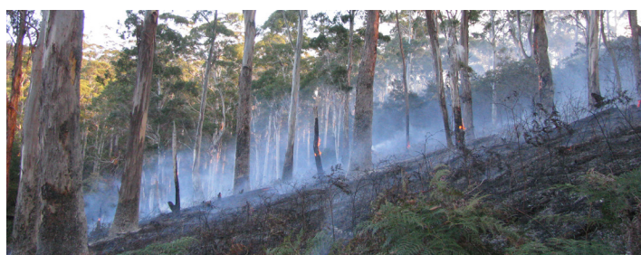
One hour after lighting – note only the heavy fuels are still alight