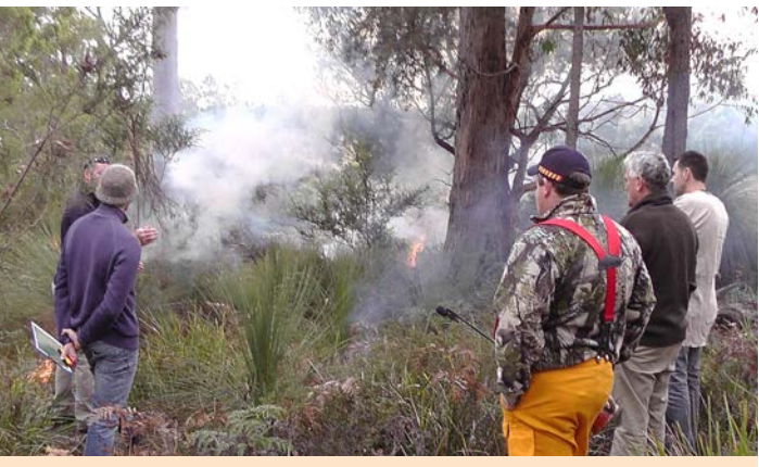
Conducting a test burn gives an indication of how dry the fuels are and how the fire is likely to behave

Due to the breeze and high fuel hazard, the lighting was kept to a minimum - this burn was lit using spots of fire (5-10m apart), with the two lighters 10-15m apart. The burn was started at 12.30 (after registering with TFS 1800 000 699) and finished at 5.00.