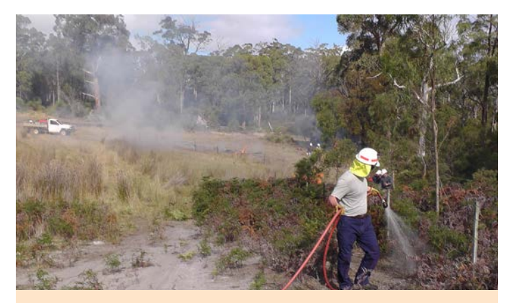
Resource set up: wetlines, lighters, mop up team

At the time of the planned burn, the block was surrounded by short, green pasture, and the entire boundary was driveable on the outside of the fence. In some places vegetation was growing through the fence. There was an internal track running east west through the unit. This enabled the burn unit to be separated into two sections, which could potentially have been burnt at different times. There were some wood heaps piled up within 5-10m inside the fence.