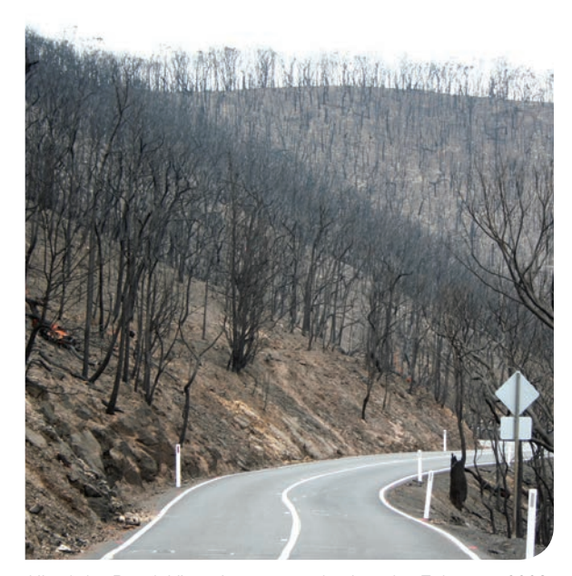
Kinglake Road, Victoria, one week after the February 2009 Black Saturday fires.

'...appropriate use of planned fire to protect communities and their assets, and to protect and conserve natural and cultural values.'