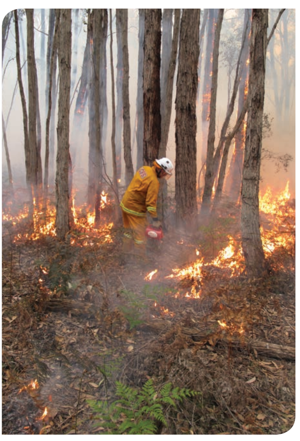
Implementing a planned fired to reduce fuel loads in native forest at Deep Creek, South Australia, in September 2011.