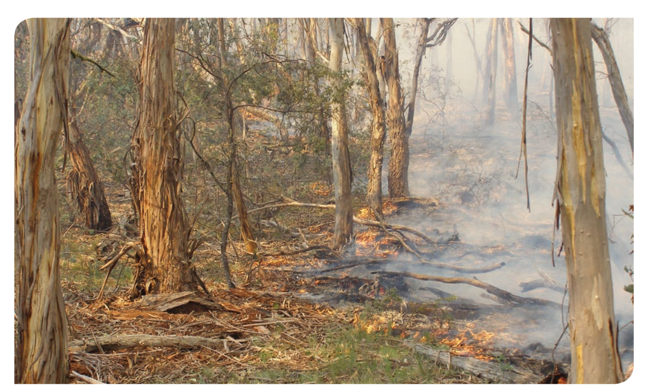
Low intensity fire in long unburnt native forest in Namadgi, ACT, 2009 (photo: Neil Cooper, ACT Parks and Conservation Service).