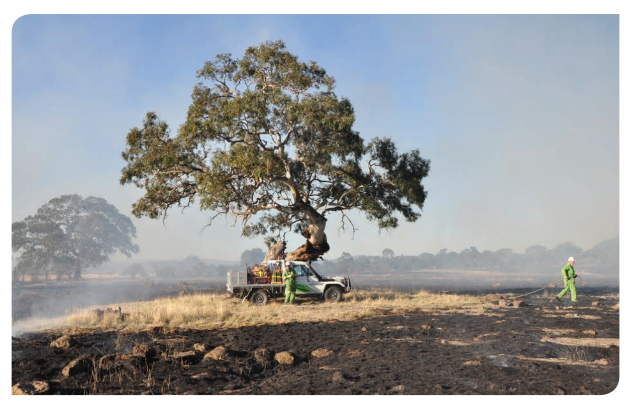
Protection of important remnant vegetation during a 2010 planned fire in Victoria.