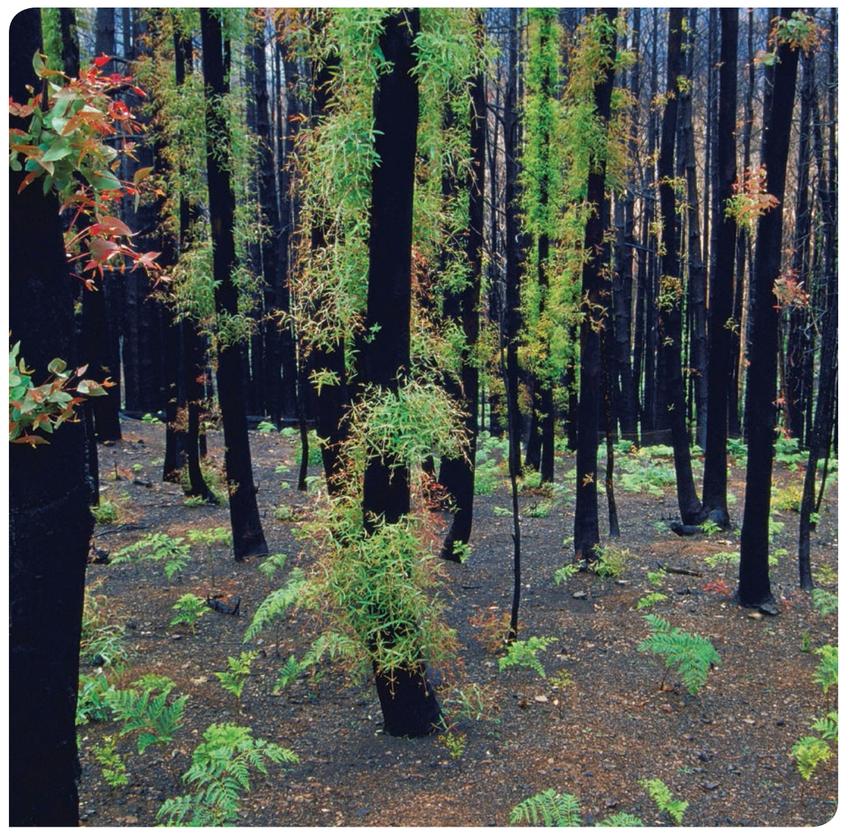
Vigorous native forest epicormic regrowth following a high intensity wild fire.

'...fire can be damaging and devastating in some circumstances, and essential for maintaining productive and healthy landscapes in others.'