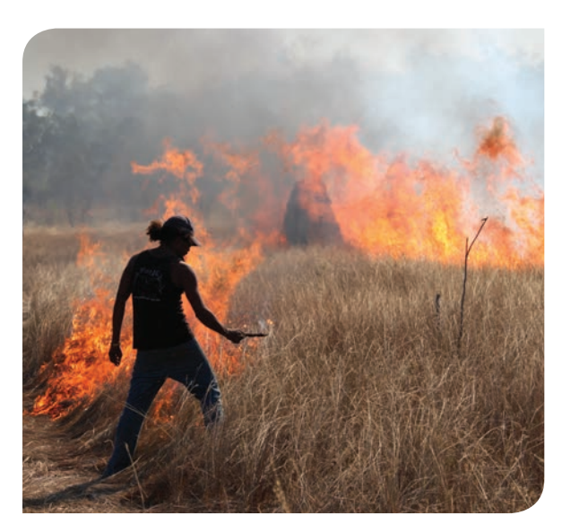
Traditional lighting of the landscape in Cape York, in July 2011.

In the meantime, land and fire managers will not let the lack of a comprehensive framework for planned fire, or short-term and local risks involved in using fire, unduly constrain the use of planned fire to manage the risk of severe fire impacts.