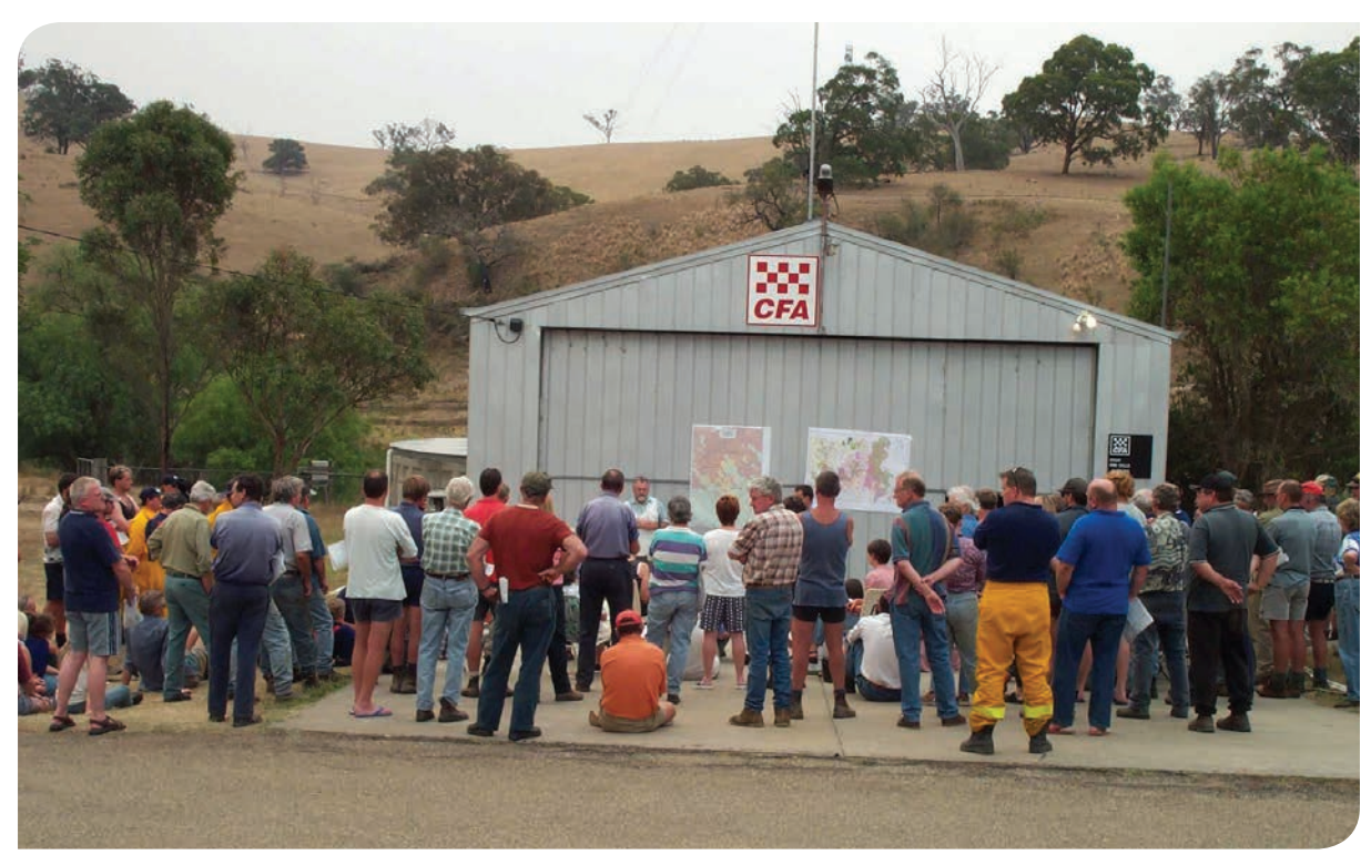
Town meeting at Swifts Creek, Victoria, in February 2003 (photo: Department of Environment and Primary Industries, Victoria).