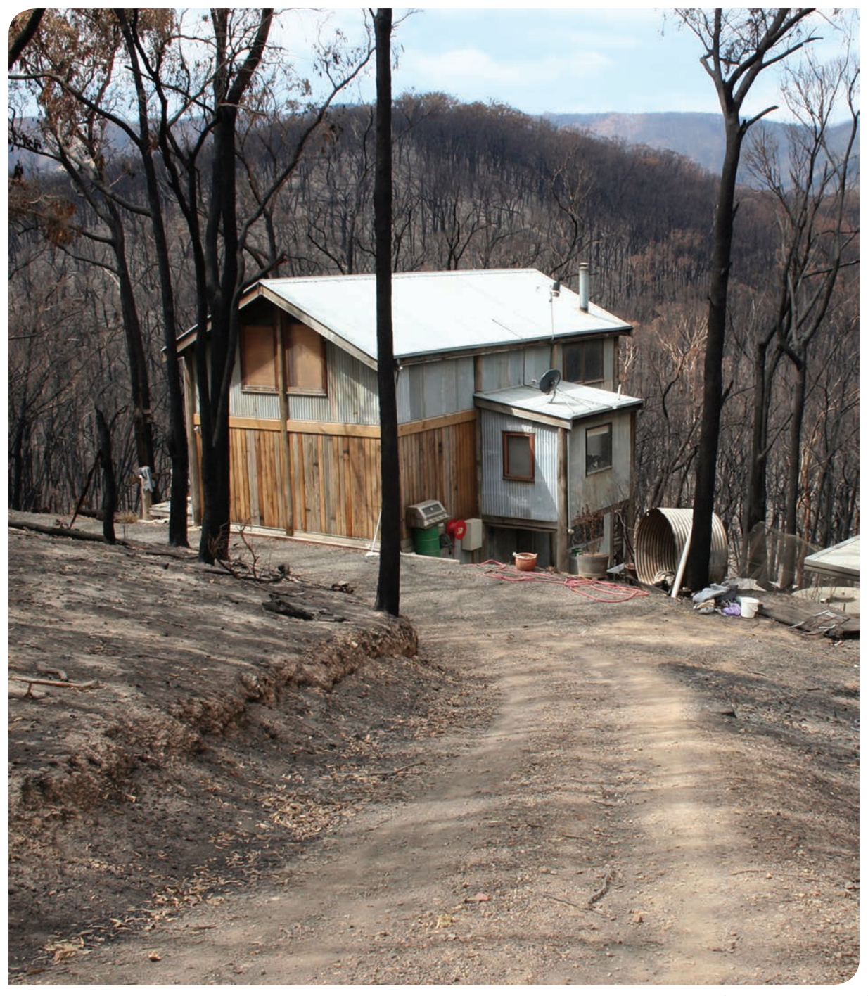
House at Strathewen, Victoria, that was successfully defended in the February 2009 Black Saturday fires.

A subset of forest plant communities in which the trees form only an open canopy (between 20 per cent and 50 per cent crown cover), the intervening area being occupied by lower vegetation, usually grass or scrub.