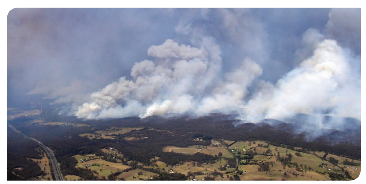
Columns of smoke from burning operations near Mittagong, NSW, during the December 2001 Black Christmas fires.

In northern Australia, few years pass without large areas being burnt. Around 90 per cent of the area of Australia burnt by fire each year is found north of the Tropic of Capricorn, with burning occurring during the dry season, generally between April and November. These fires usually have a relatively low economic impact because of the low population density and the dispersed nature of built assets. Increasingly however, we are gaining a better understanding of the effect of these fires on biodiversity, greenhouse gas emissions and carbon balances. In the grazed rangelands of northern Australia, fire remains both a threat to livelihoods and a valuable tool for managing pastures, weeds and livestock and for maintaining land condition.