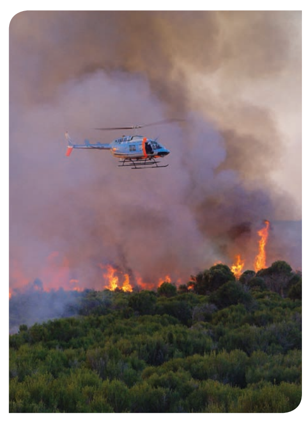
Planned fire in coastal forests using aerial incendiary operations in South Australia, 2001.

Australia plays a significant role within the international bushfire management community. Our achievements in fire research, bushfire mitigation and management, and community involvement, are increasingly influencing approaches to bushfire management worldwide. A clear vision and policy, aimed at improving the management of fire by land and bushfire management agencies and communities, will consolidate this international contribution.