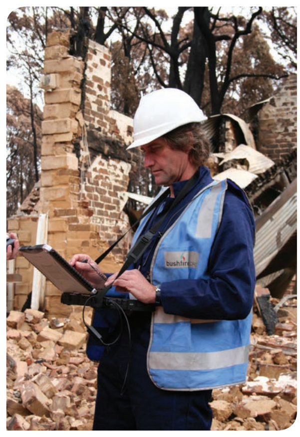
Member of the Bushfire CRC multiagency research task force analysing destroyed properties at Kinglake, Victoria, one week after the February 2009 Black Saturday fires.