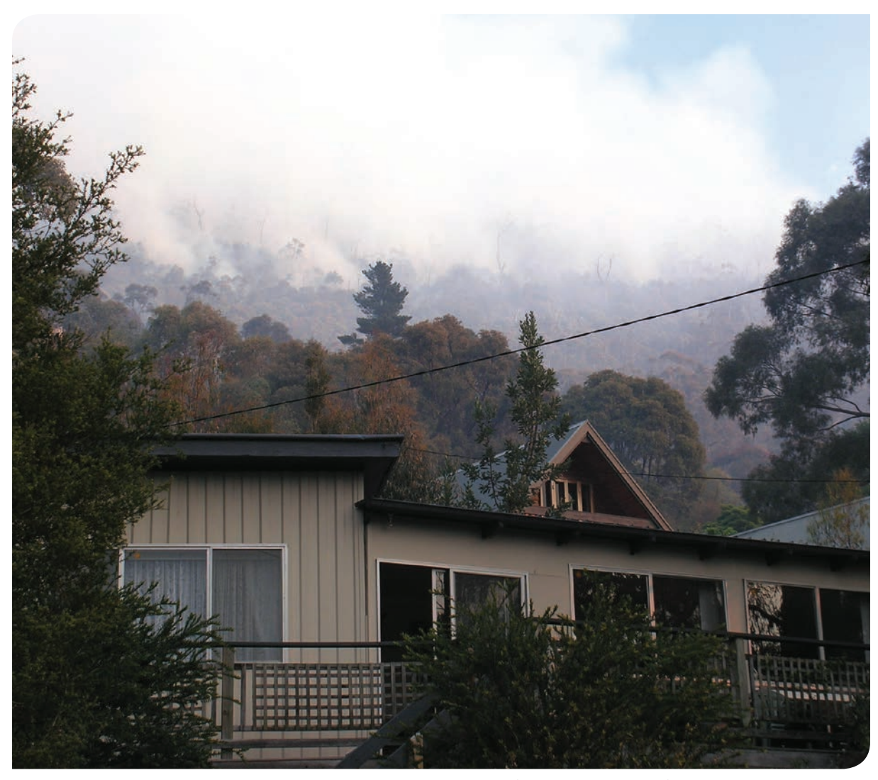
Planned burning to minimise the risk and impact from unplanned fires.

All governments have agreed to take responsibility for implementing this statement. Several of the policies contained within this statement can be implemented immediately; others depend on further work. Reports on the implementation of progress will be prepared by the Forest Fire Management Group – a committee of government officials from production and conservation forest management agencies.