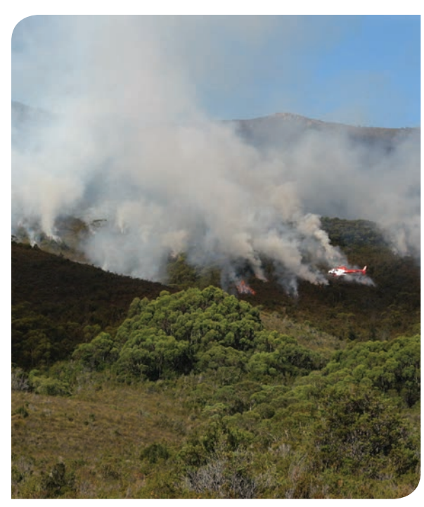
2011 fuel reduction burn at Red Tape Creek, Tas, using aerial incendiaries.