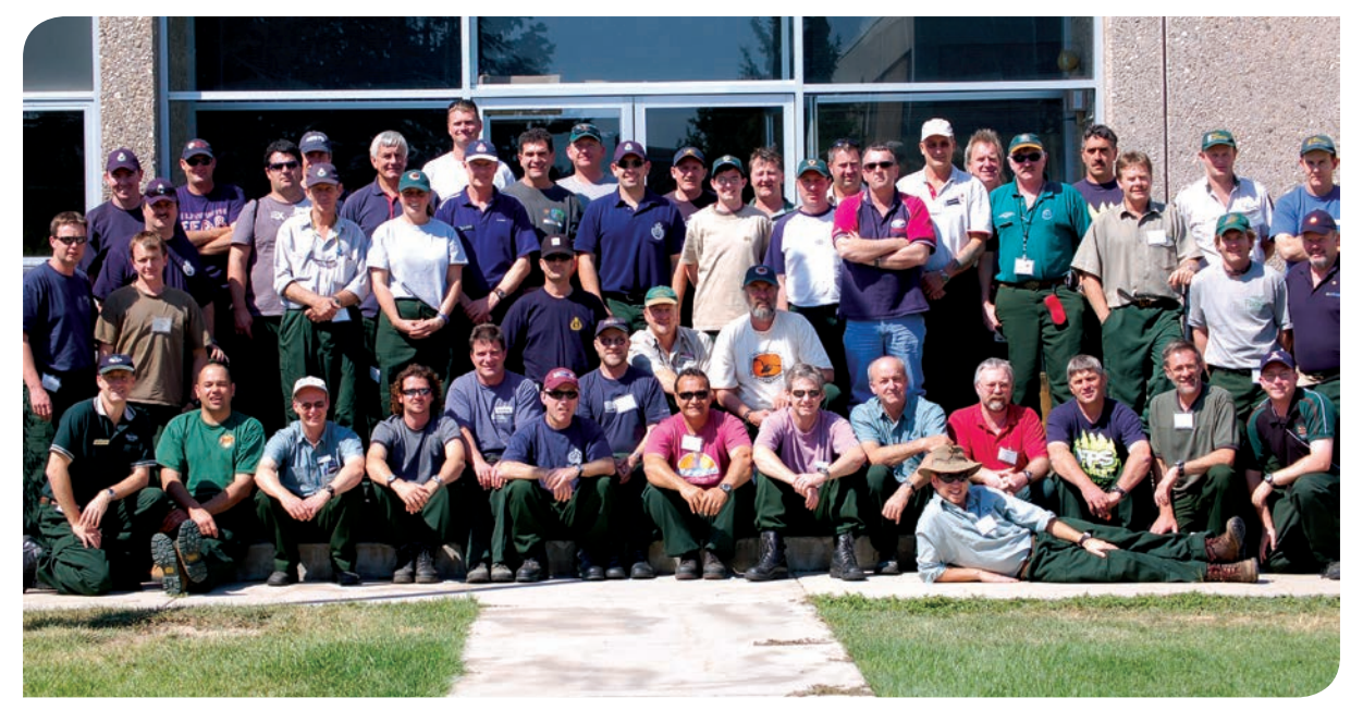
International deployment of Australian/New Zealand fire fighters to the United States of America – Boise, Idaho, August 2006 (photo: Parks Victorial.