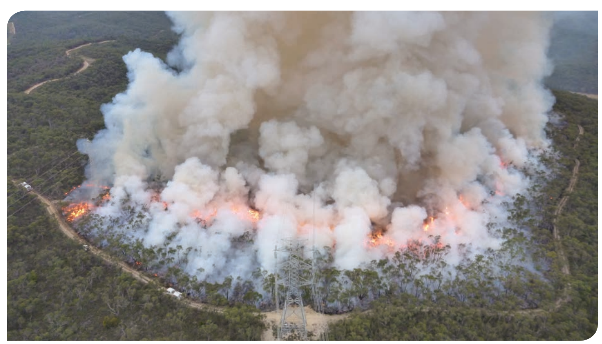
Utilising internal draw and convection currents in a planned fire in South Australia, in 2011.

A source of potential harm or a situation with potential to cause loss.