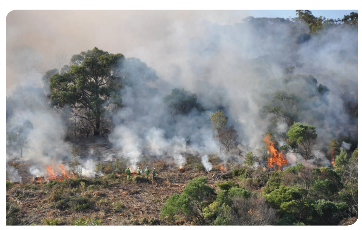
High intensity post harvest slash burn at Rosebud, Victoria, in 2010 to ensure healthy and vigorous regeneration.

Manage planned fire and unplanned fire (where appropriate), to reduce the risk of severe bushfires impacting on communities, and enhance the health, biodiversity and resilience of Australia's forests and rangelands. Underpinning this goal is an understanding that planned and managed fire can play a positive role in reducing the scale and magnitude of bushfires, and promote more healthy and productive forest and rangeland ecosystems.